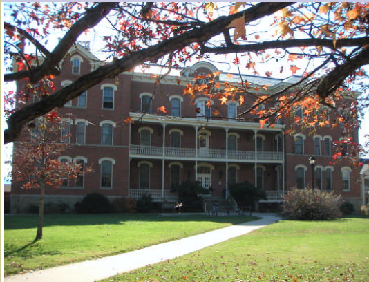
FAIRCHILD RESIDENCE HALL